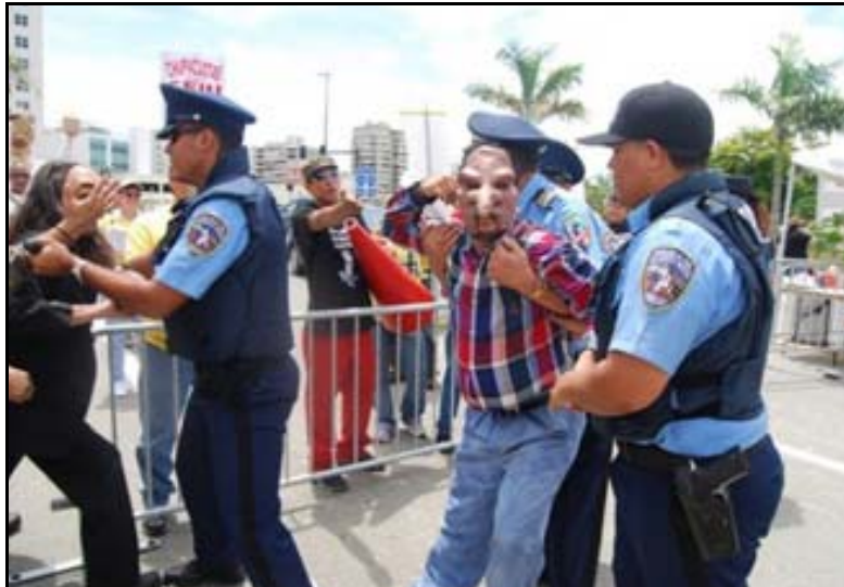
Puerto Rican Police arresting activists for doing street theater!

Dating from November 19, 2008, the Table of Solidarity Against Repression warned people of the continuing tendency to federalize institutions and life in Puerto Rico. The current governor Luis Fortuño continues and emphasizes the hand-over of our institutions, especially those related to justice, to the hands of the U.S. Attorney, the FBI, and the federal court in Puerto Rico.